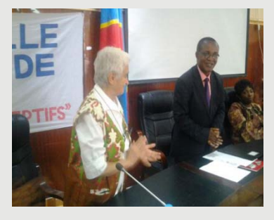
CTMP at the province level, to boost DRM (i.e. South Kivu)